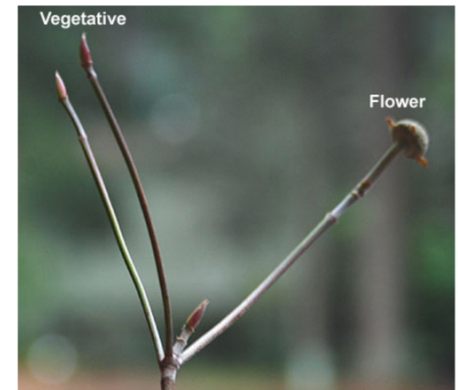
winter twigs and buds